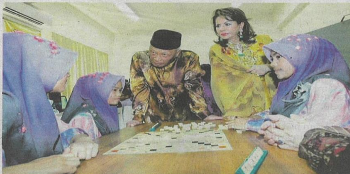
KENANGAN... Almarhum Sultan Ahmad Shah berkata sesuatu kepada penghuni Taman Pengasih ketika Majlis Perasmian Taman Pengasih Sultan Haji Ahmad Shah Bandar Indera Mahkota. Di kanan baginda ialah Sultanah Kalsom.

Bagi Almarhum Sultan Ahmad, rakyat adalah keutamaannya dan baginda yang lebih mesra membahaskan dirinya 'saya' juga sentiasa memantau pembangunan di Pahang dan tidak teragak-agak untuk menergur pihak yang terlibat jika menda-