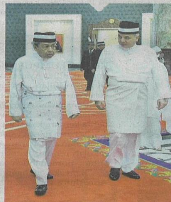
Sultan Perak, Sultan Nazrin Shah (kanan) bersama Sultan Selangor, Sultan Sharafuddin Idris Shah berkenan berangkat bagi memberi penghormatan terakhir kepada Almarhum Sultan Ahmad Shah di Istana Negara semalam. Turut berkenan hadir, Sultan Johor Sultan Ibrahim Almarhum Sultan Iskandar.

Keperibadian mulia baginda itu sesungguhnya banyak membantu dalam membangunkan negeri demi kesejahteraan rakyat.