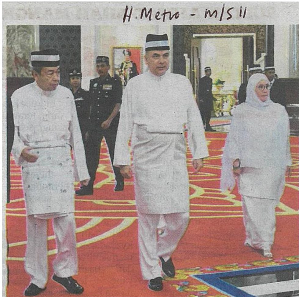
RAJA Permaisuri Agong, Tunku Azizah Aminah Maimunah Iskandariah (kanan) berkenan mengiringi Sultan Perak, Sultan Nazrin Shah dan Sultan Selangor, Sultan Sharafuddin Idris Shah yang berangkat bagi memberi penghormatan terakhir kepada Almarhum Sultan Ahmad Shah.