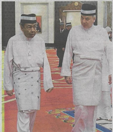
Sultan Nazrin Shah bersama Sultan Sharafuddin Idris Shah berkenan berangkat memberi penghormatan terakhir kepada Almarhum Sultan Ahmad Shah di Istana Negara, semalam.