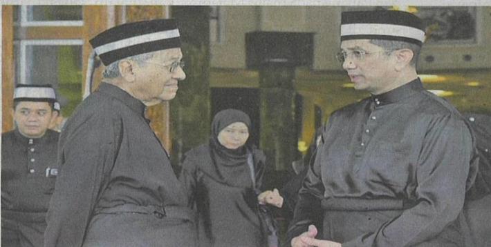
Perdana Menteri, Tun Dr Mahathir Mohamad berbual dengan Menteri Hal Ehwal Ekonomi, Datuk Seri Mohamed Azmin Ali selepas memberi penghormatan terakhir kepada Sultan Pahang Kelima, Almarhum Sultan Ahmad Shah di Istana Negara.