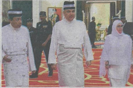
Solemn farewell: Raja Permaisuri Agong Tunku Azizah Aminah Maimunah Iskandariah accompanying Sultan Nazrin Shah (centre) and Sultan Sharafuddin Idris Shah to pay their last respects to the late Sultan Ahmad Shah at Istana Negara in Kuala Lumpur while (right) Dr Mahathir is accompanied by Economic Affairs Minister Datuk Seri Azmin Ali.

"My heartfelt condolences to the entire Pahang royal family over the passing of Paduka Ayahanda Sultan Ahmad Shah Al-Musta'in Billah ibni Almarhum Sultan Abu Bakar at the